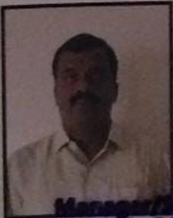
Manager/Secretary Sree Mahesh English Medium School N.H. 44, Changanassery (V) Puducherry (K. Ananthapuram Dist.)